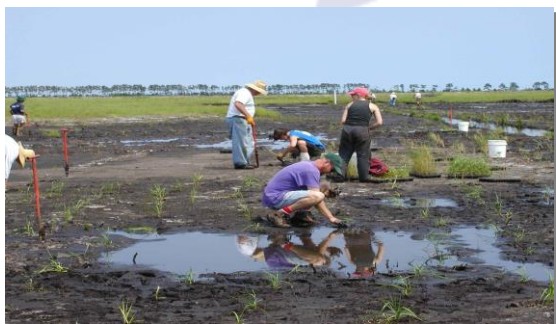
Fig.1 Vegetative Enhancement

In this process, some suitable plants are planted in the wetland to balance the ecosystem. This is the method generally used nowadays. There are so many projects for the enhancements and maintenance of the wetland.